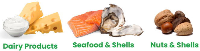
Dairy Products Seafood & Shells Nuts & Shells