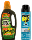
Pesticides & Insecticides