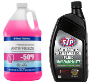
Antifreeze or Brake & Transmission Fluid