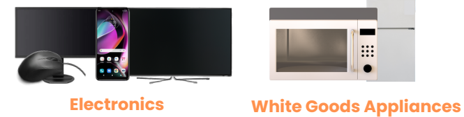
Electronics White Goods Appliances