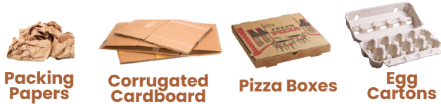
Packing Papers Corrugated Cardboard Pizza Boxes Egg Cartons