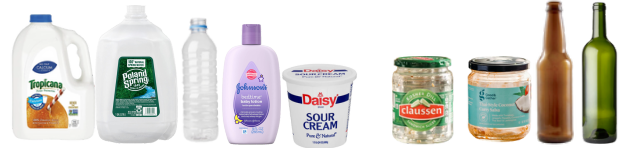
Plastic Bottles, Jugs, Containers Glass Bottles & Jars