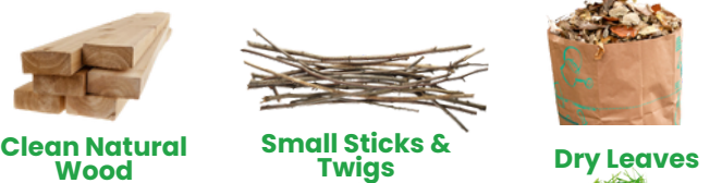
Clean Natural Wood Small Sticks & Twigs Dry Leaves

Yard waste does NOT belong in the food scraps drop-off or collection