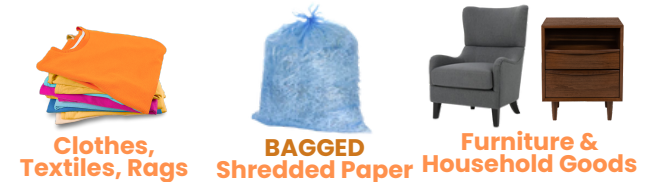
Clothes, Textiles, Rags BAGGED Shredded Paper Furniture & Household Goods