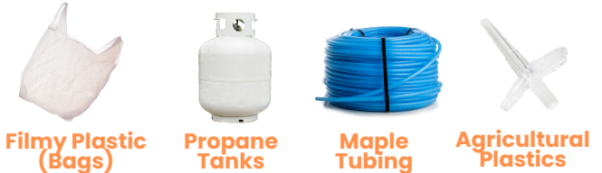
Filmy Plastic (Bags) Propane Tanks Maple Tubing Agricultural Plastics