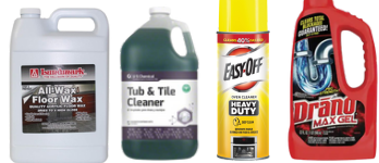
Drain Openers, Oven Cleaners, Floor Wax