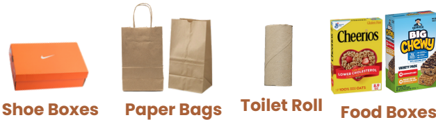
Shoe Boxes Paper Bags Toilet Roll Food Boxes