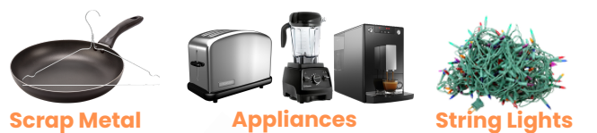
Scrap Metal Appliances String Lights