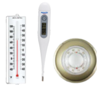
Mercury Added Products