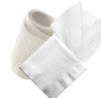
Tissues, Paper Towels, Toilet Paper, Napkins