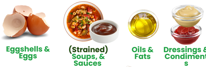
Eggshells & Eggs (Strained) Soups, & Sauces Oils & Fats Dressings & Condiments