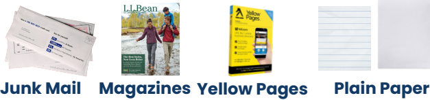
Junk Mail Magazines Yellow Pages Plain Paper