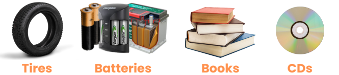
Tires Batteries Books CDs