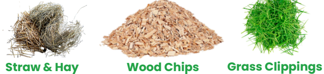
Straw & Hay Wood Chips Grass Clippings