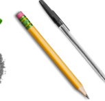
Pens & Pencils