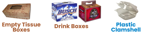
Empty Tissue Boxes Drink Boxes Plastic Clamshell