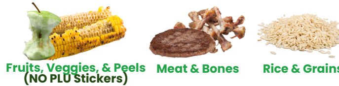
Fruits, Veggies, & Peels (NO PLU Stickers) Meat & Bones Rice & Grains