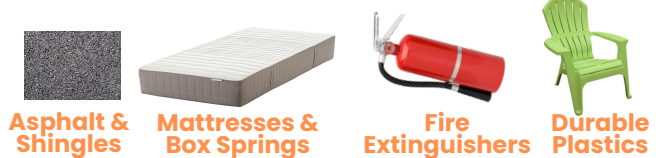
Asphalt & Shingles Mattresses & Box Springs Fire Extinguishers Durable Plastics