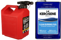
Gas, Kerosene, Oil