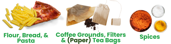
Flour, Bread, & Pasta Coffee Grounds, Filters & (Paper) Tea Bags Spices

Yard waste does NOT belong in the food scraps drop-off or collection