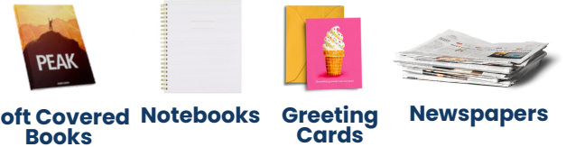
Soft Covered Books Notebooks Greeting Cards Newspapers